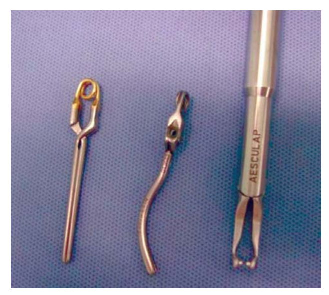
Fig. 2 - Pinças de bulldog para procedimentos videolaparoscópicos

With the introduction of the viewing scope in the right atrium, the tricuspid valve, the coronary sinus and the IAC were inspected. A pericardial bovine patch was used to